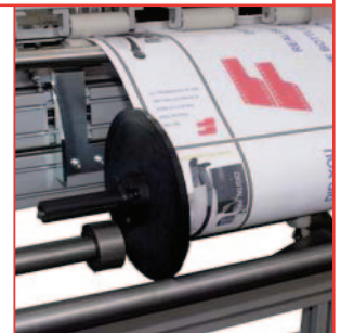
Easy loading of heavy rolls